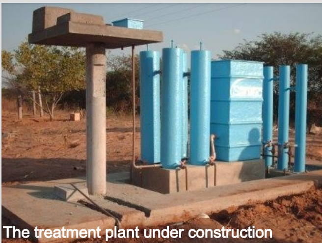
The treatment plant under construction