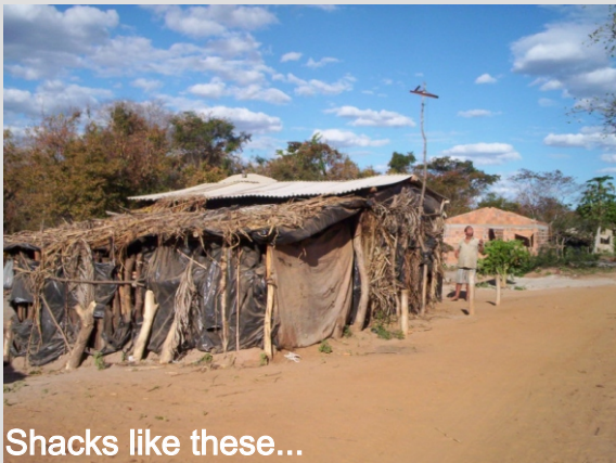
Shacks like these...