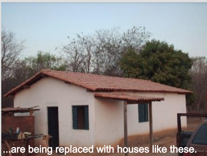
...are being replaced with houses like these.