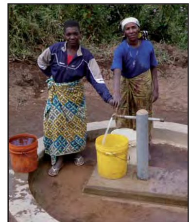
A clean water source in the village