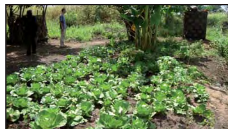
Learning to grow a kitchen garden