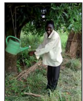
A tippy-tap handwashing station