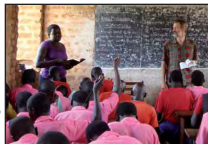
Teaching girls about sanitary hygiene and keeping them in school for longer