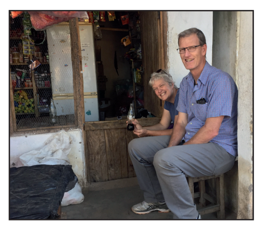
A cold Coke is only a 20 minute walk away!

Through such tools as contextual photos, wordless stories, and shared experiences we are exposed to the language Malawians use to describe