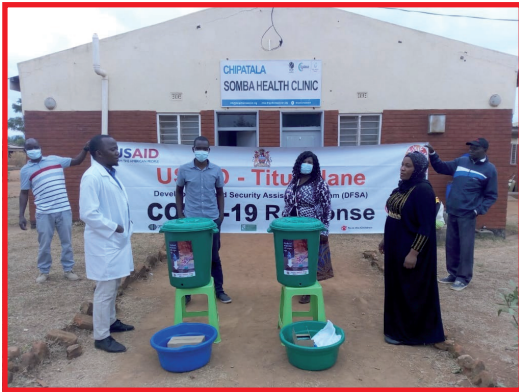
PPE distribution at Somba Health Clinic in Traditional Area Mbwanyambi