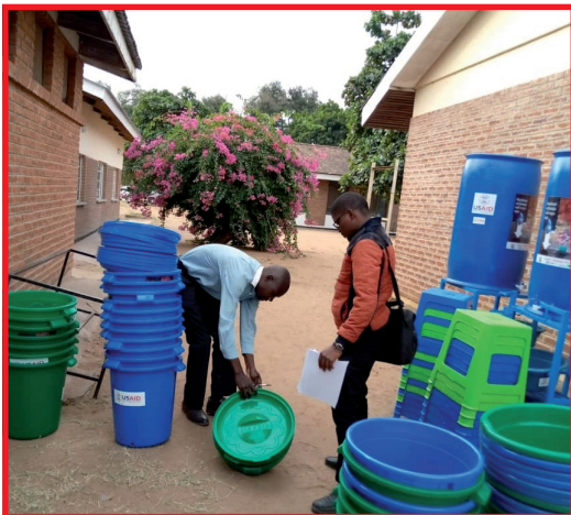
Mangochi district hospital stores department receiving and verifying PPE's

Balaan tribe. Tacurong, Sultan Kuderat 61 families were helped with grocery packs. These were itinerant workers to the area who were stranded when COVID-19 lockdown occurred and couldn't return to their homes.