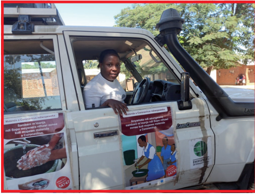
Emmanuel International Titukulane project vehicle branded with COVID-19 messages.