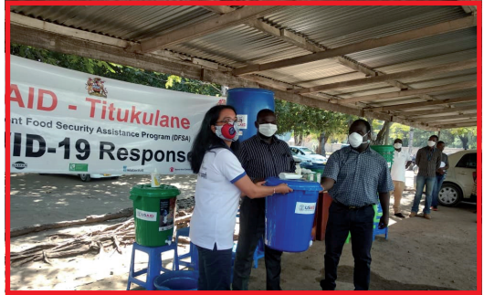
Handing over the PPEs and the hand washing facilities at Mangochi District

Symbolic presentation and handover of Personal Protection Equipment (PPE) and Non-Food items (NFI) at Mangochi District Council offices - 42 participants attended the function.