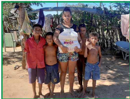
Food distribution in Espinosa

helping them with food packages. We also distributed Bibles in some communities.