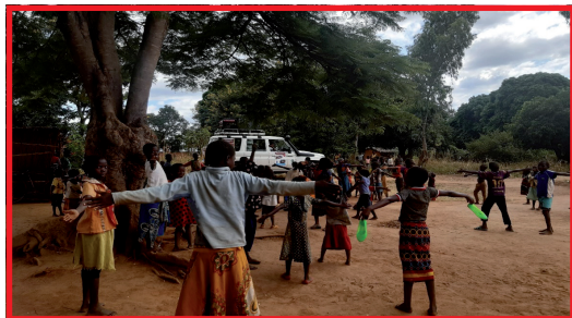
Kids demonstrating social distancing

Training of on New COVID-19 Community Based Management of Acute Malnutrition (CMAM) and Infant and Young Child Feeding (IYFS) - 510 Government Nutrition frontline staff